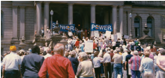
Older adults advocating for senior services in Lansing

Over the years, older adults and service providers have advocated with state and federal elected officials for more funding for older adult programs. These efforts have enabled AAAWM to help more seniors stay in their own homes. Today there are over 25 OAA services provided by 85 different agencies throughout our region.